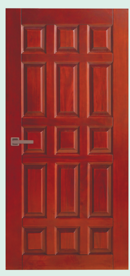
SPD - 08