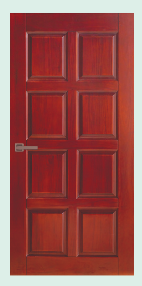
SPD - 05