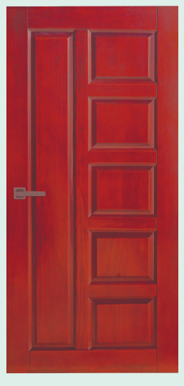
SPD - 03