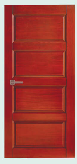
SPD - 02