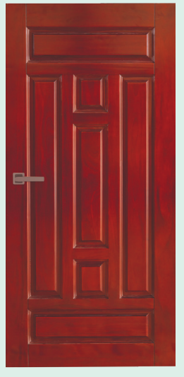
SPD - 07