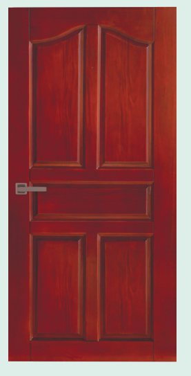
SPD - 04