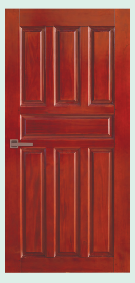
SPD - 06